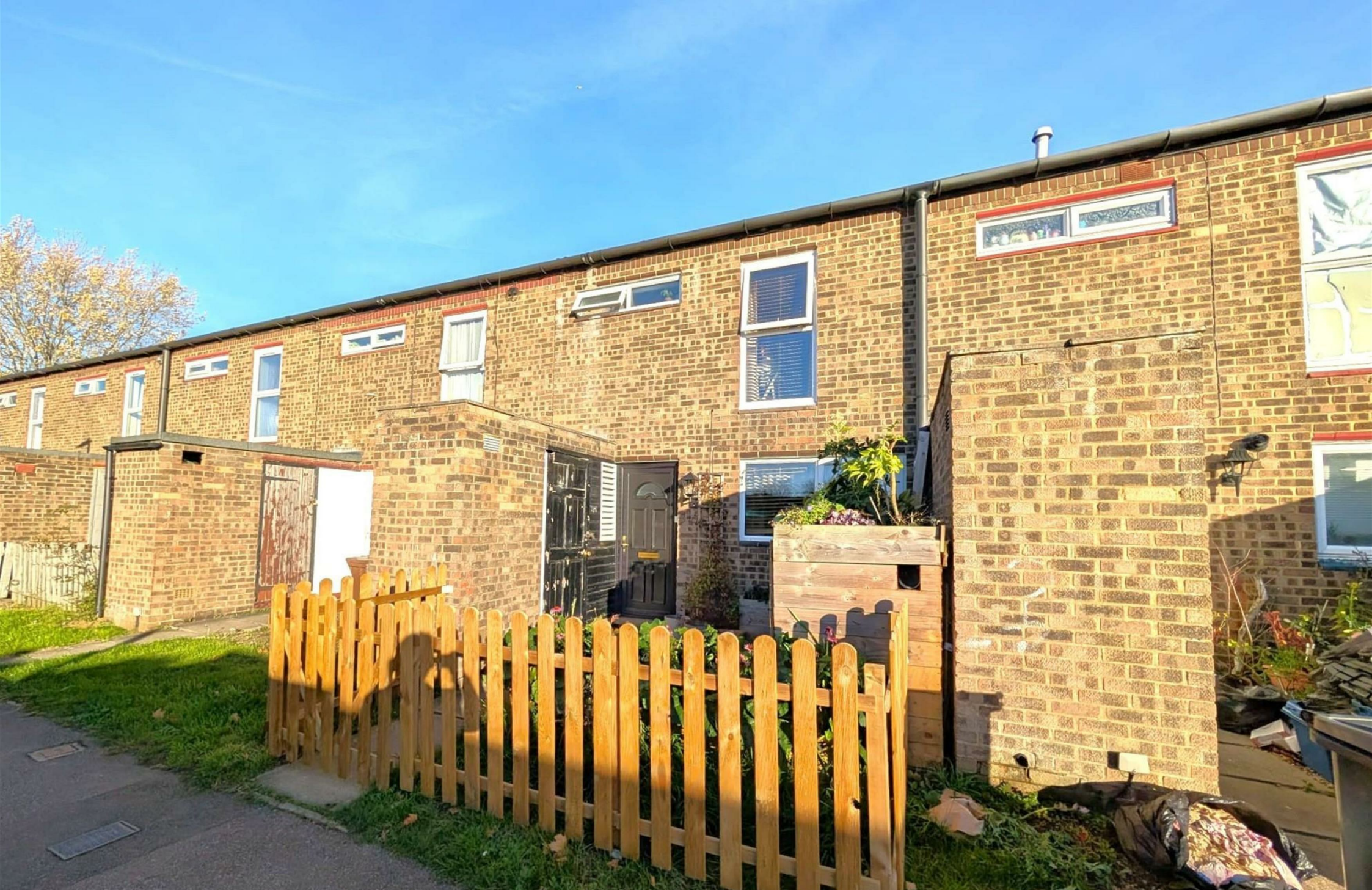
Ripon Road, Stevenage